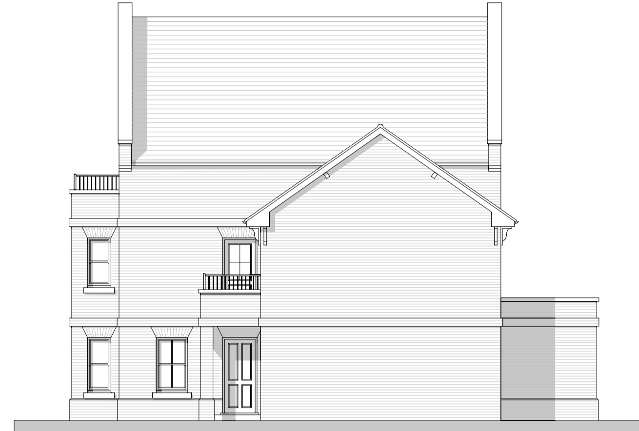
02 Existing North East Elevation 02100 Scale 1 : 100