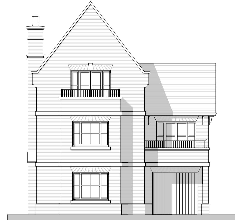
01 Existing South East Elevation 02101 Scale 1 : 100