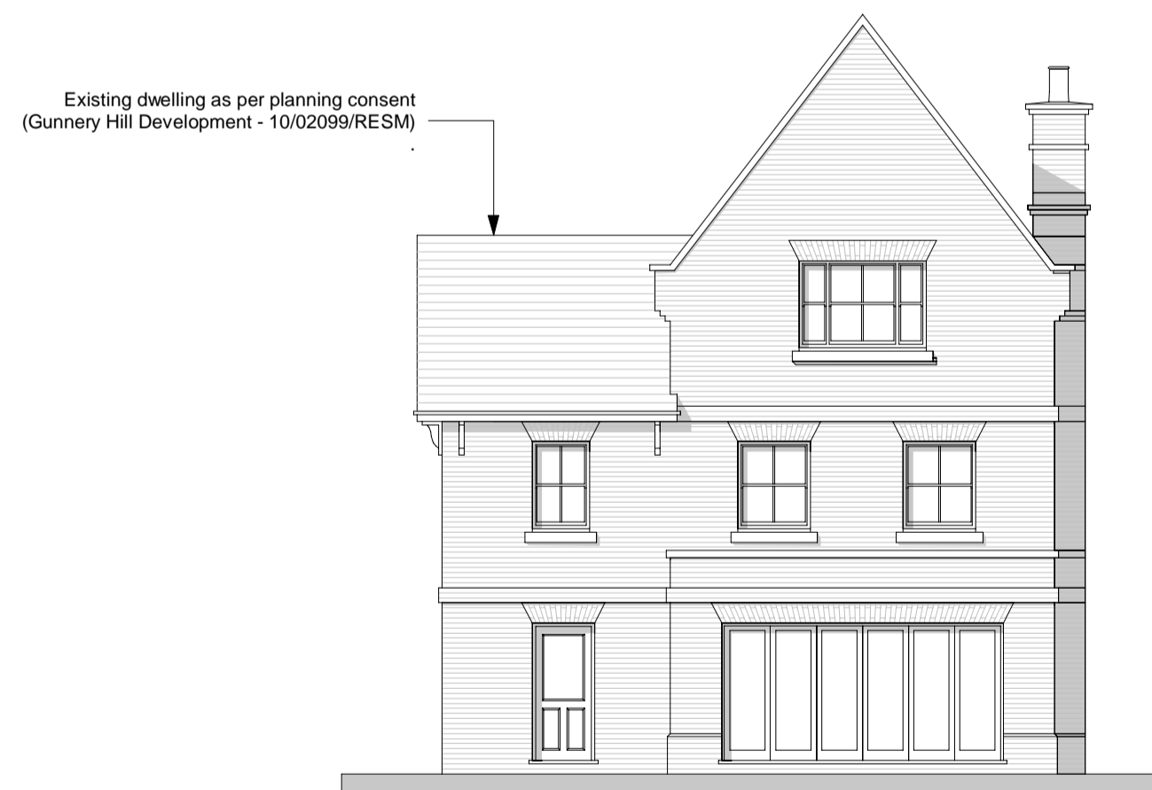
03 Existing North West Elevation 02100 Scale 1 : 100