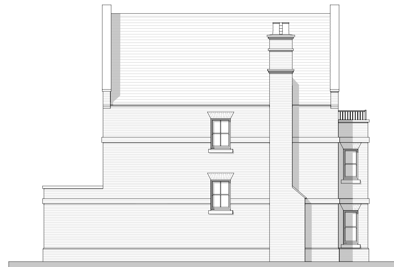
04 Existing South West Elevation 02100 Scale 1 : 100